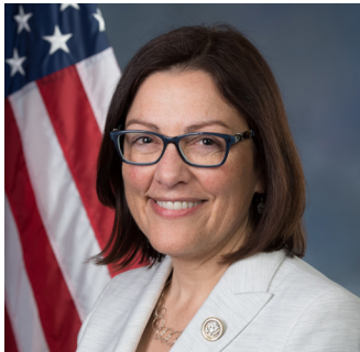
Rep. Suzan DelBene (D-WA)